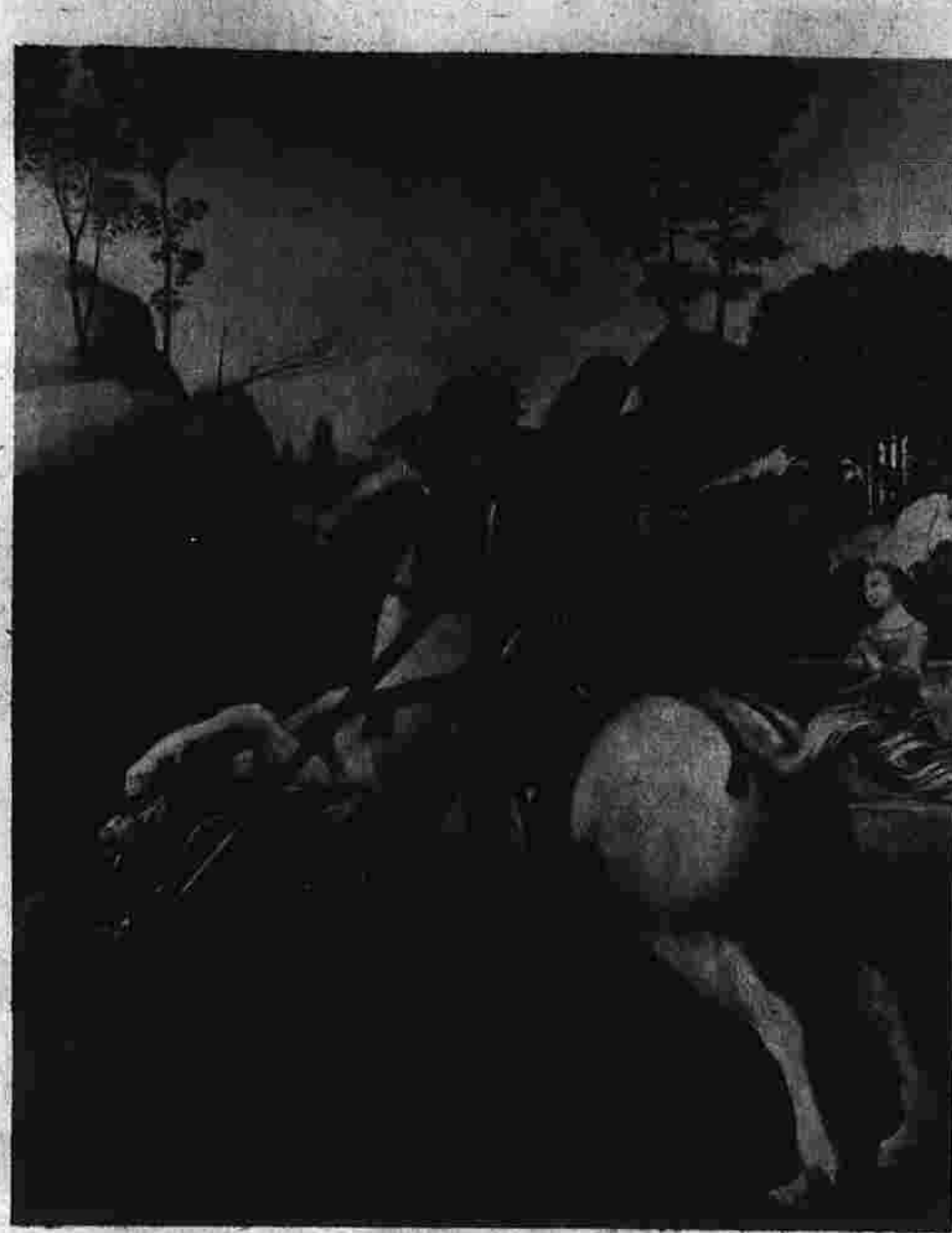
Overway National Gallery of Art, Washington, D.C. RAPHAEL'S SAINT GEORGE AND THE DRAGON

For every visit by anybody anywhere which lasts more than a week, there are two great, wonderful feelings: the one that of the visitor who finds himself safe back in his own home and all its familiar comforts, and the other that of the host who, even with the nicest guest in the world, cannot help but experience an exquisite joy of relief when the guest has finally gone and things can gradually be put back in their proper places.